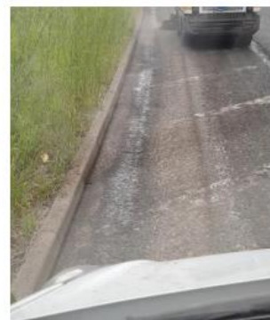
Owlcotes Slip Road Clean June 2022