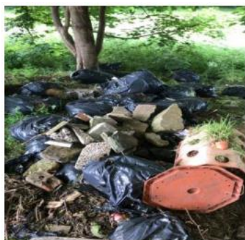
Gilpin St fly tipping