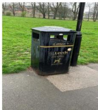
Bin relocated to Sycamore Grove

22. We have also completed some large cutting jobs and fly tipping removals and replaced a number of damaged litter bins.