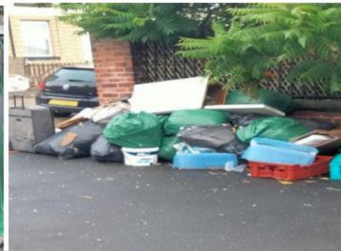
Roderick Street Fly tipping

25. We have already completed some traffic island cleaning, but we still have a few left to do which we will look to plan in and book the light road safety vehicle. We have done the layby on the Stanningley Bypass above and the Owlcotes slip road towards the garage (Photos under street cleansing) we will be planning the vegetation cut back later on this year, when it starts dying back so we can get a better cut back.