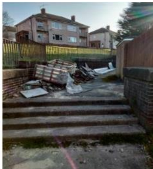
Tong Rd fly tipping