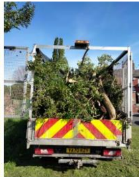
Mulberry St overgrown