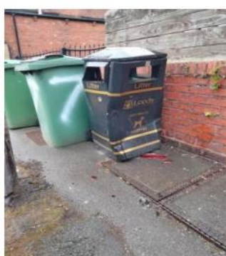
Oldfield Lane crash Damage bin replaced